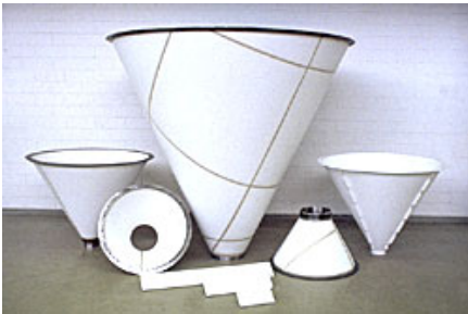
Aeration trays and hoppers